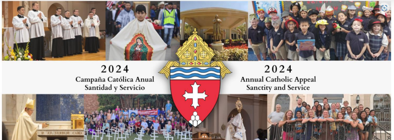
2024 Campaña Católica Anual Santidad y Servicio