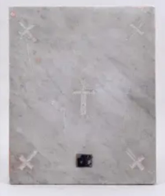
The relics are often sealed into the altar.

St. Benedict the Moor was a humble man. He ate only plain simple food, lived on the barest essentials, and lived barefoot all year around. He put the needs of others before his own. Serving and praying for those around him. The Resurrection of Jesus served as a new beginning. Sin was removed and God's people restored. Consider this week a way that you can restore God's commandments of us in your own life? How can you help restore and serve others?