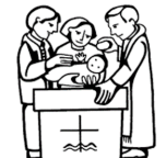
I baptize you in the name of the Father and of the Son and of the Holy Spirit