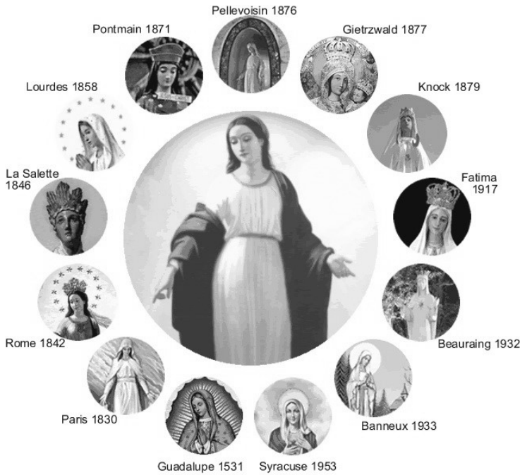
Apparitions of the Blessed Mother, Mary

In today's Gospel we hear that Jesus calls to his disciples to travel light. They bring with them only what is absolutely necessary. And still without any "extras" they were able to do God's work. How often do we follow into the trap of thinking we need more? We don't need much to do God's work in our own lives.