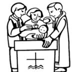
I baptize you in the name of the Father and of the Son and of the Holy Spirit