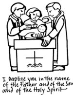
I baptize you in the name of the Father and of the Son and of the Holy Spirit

Call for appointment/Llame para pedir cita